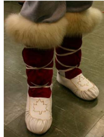
Illustration 2: Canadian-inspired buckskin uppers with coyote fur.