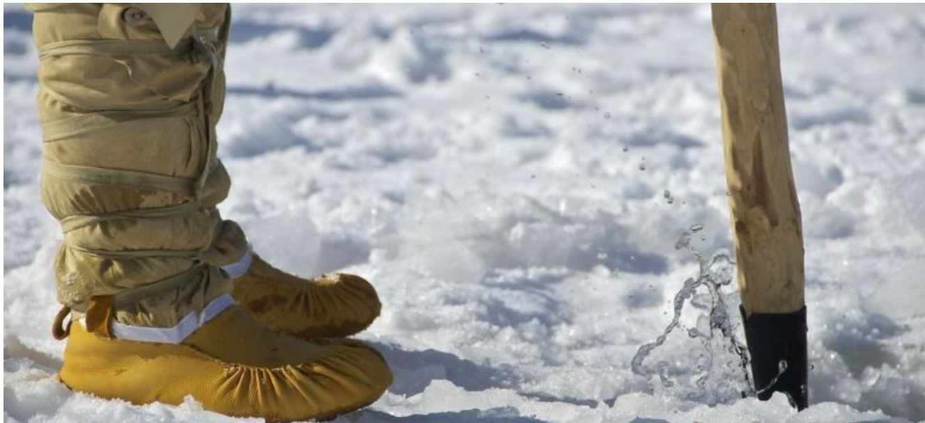
Illustration 1: A typical pair of wrap-around uppers using boar skin. Photo shows: deer antler button near top, wrap-around cotton lacing, white cotton binding tape to reinforce seam and ankle tabs to hold lace.

Our buckskin upper style was developed through our workshops in an effort to provide participants with: