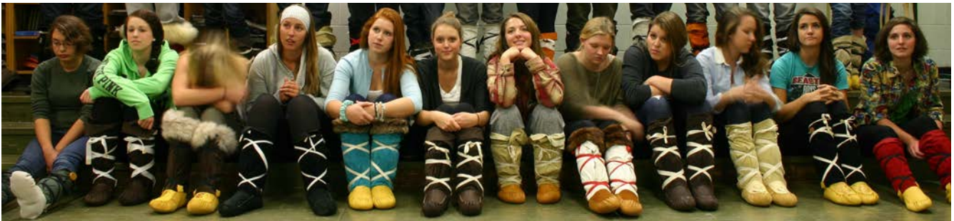
Illustration 4: A bevy of buckskin uppers out of Georgian Bay Secondary School's Outdoor Pursuits Prog.

You should have all your insulating layers on hand to properly size your uppers. Insulating layers are covered in more detail in booklet 1.