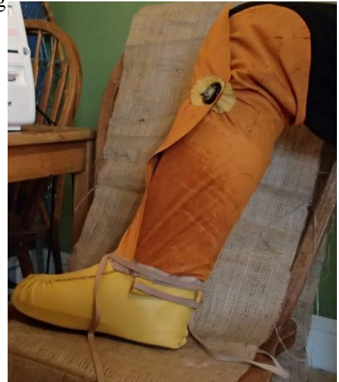
Illustration 10: Showing the button location.