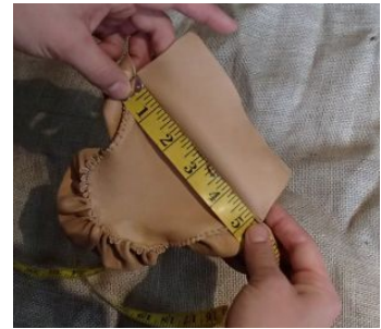
Illustration 6: Measuring straight across the vamp.