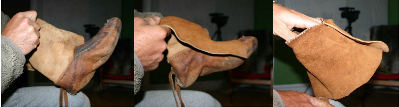
Illustration 7: Moccasin and finished upper, both right-side out.