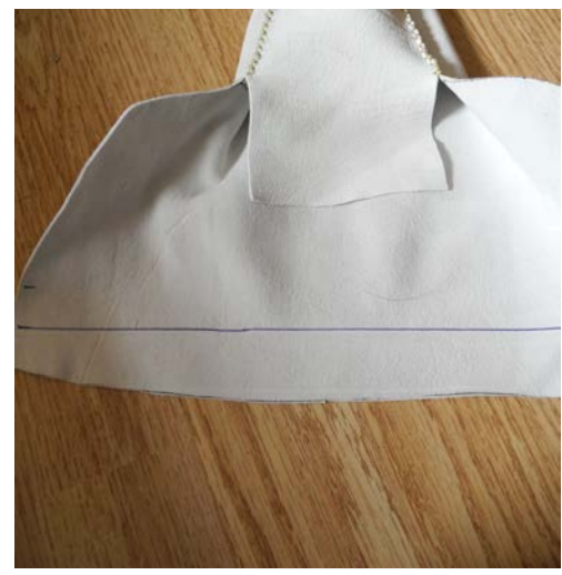
Illustration 16: Draw a straight line across the rear of your moccasin from point to point and trim. REMEMBER: this should be HALF the overlap measured!