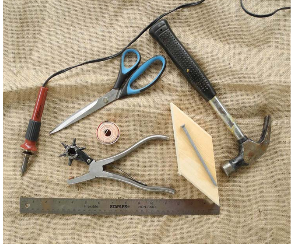
Illustration 4: You need only supply a few standard household items.