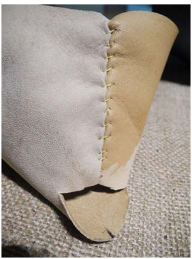
Illustration 18: The flattened seam