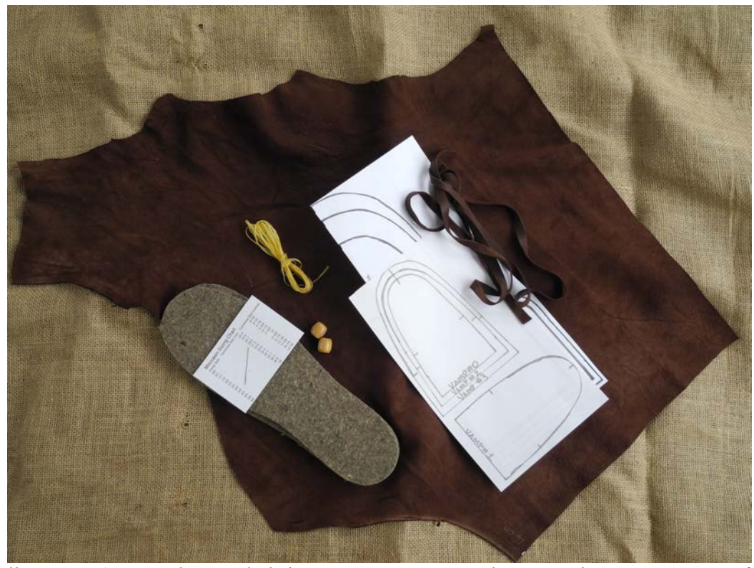
Illustration 3: Everything included in a summer moccasin kit. Note: there are a variety of deerskin colours available - contact for current availability.

A summer moccasin kit includes all of the items listed and shown below. If you are not purchasing a kit, you can acquire these items separately.