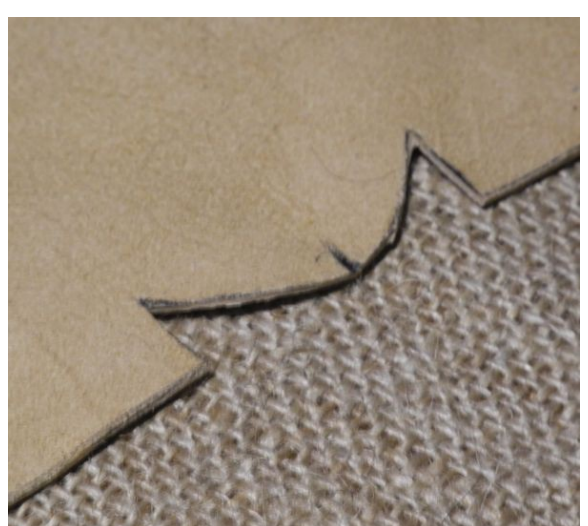
Illustration 17: The "heel crescent", drawn and cut out at the rear of the moccasin.