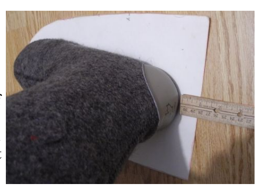
Illustration 7: This (winter) pattern is too short, and should be extended \sim 2 ".

Once you have selected the appropriate pattern (with a kit) or resized the pattern in this booklet (without a kit), it is time to ensure the pattern has adequate length. Measure the length of your foot (wearing your socks) from toe to heel. The length of your "sole" pattern piece (measurement "L" in the diagram above) should be \sim 3" longer than the length of your foot. If it is not, increase the length of your sole piece, straight back, as much as necessary. [Note: If you have to increase the length of your sole pattern significantly, you may have to make length adjustments to your vamp as well.]