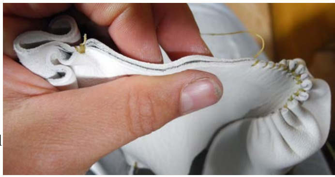
Illustration 12: Once the vamp and sole line up as shown, you are finished puckering!