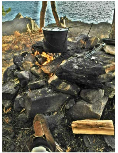
Illustration 1: Lure of the North moccasins at an evening "mug up"

Though we love them as camp shoes, your moccasins can also work great as light-duty footwear on dry days in the bush, as minimalist running shoes, as slippers around the home or camp, or anywhere else you want a beautiful, functional pair of lightweight shoes.