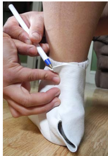
Illustration 14: Wrap the and mark the overlap.

You may recall in step 1.3, when creating our patterns, we intentionally left our patterns too long and did not worry much about exact length measurements. Now that our toes are done, we can trim the heel to length to achieve a truly custom fit! You will appreciate the help of a friend in marking the heel.