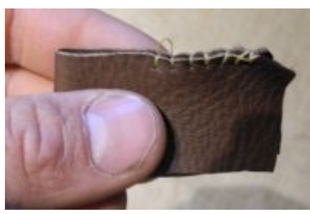
Note – Whip Stitch Details: