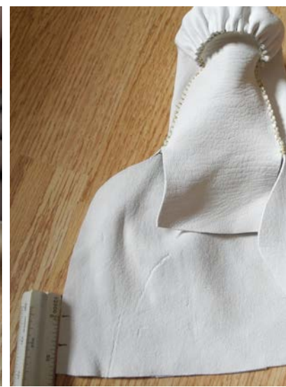
Illustration 15: Divide that moccasin around your heel overlap by two and make a new mark.