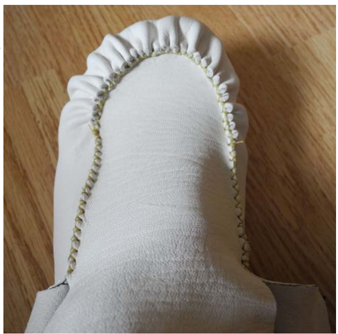
Illustration 13: Toes complete!

While the pucker is still fresh in your mind, complete the toes of your other moccasin. You are now done doing pucker stitches. Phew!