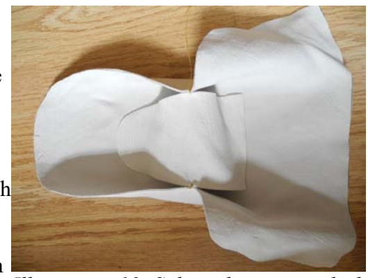
Illustration 10: Sole and vamp - tacked and ready to go!

Note: These are temporary tacking stitches which can