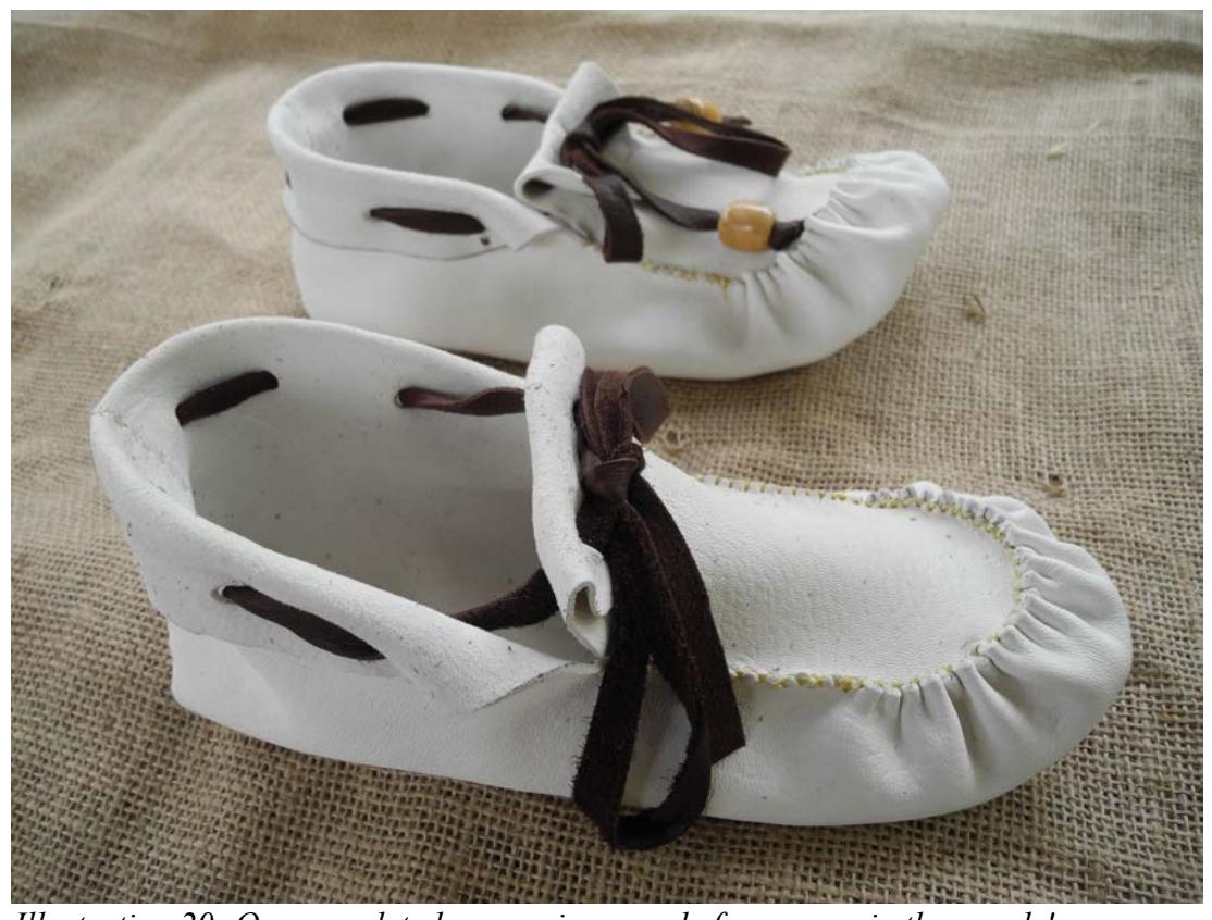
Illustration 20: Our completed moccasins - ready for a romp in the woods!